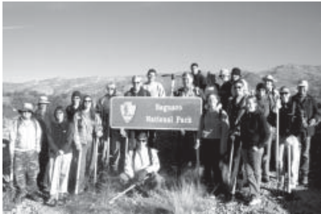
Saguaro Revegetation Effort

Saguaro National Park embraces the City of Tucson on both its western and eastern boundaries. Established as a monument in 1933, expanded to include the Tucson Mountain District on the east side in 1961, and designated as a National Park in 1994, this area is home to the icon of the Sonoran Desert, the saguaro, but contains an abundance of other plants and animals as well.